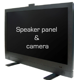
Speaker panel & camera