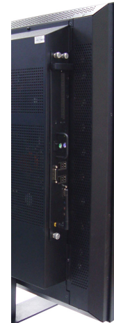
Display Engine Module